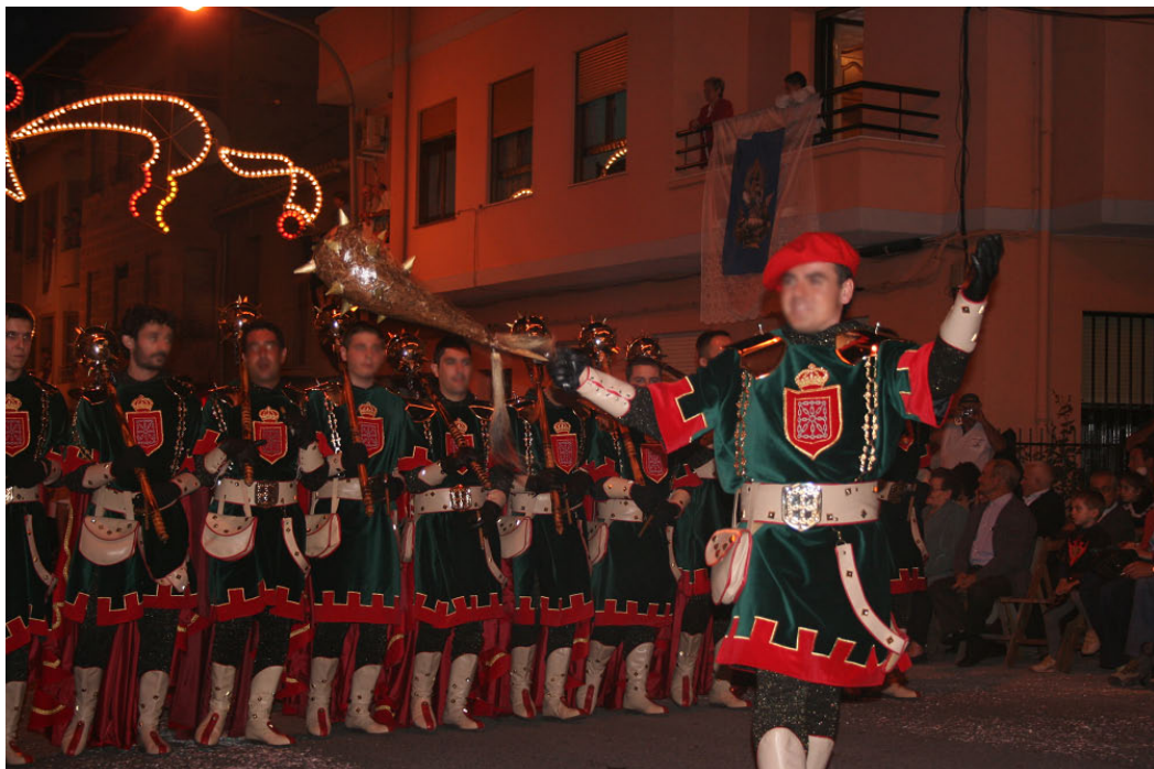
Festival of Moors and Christians, Alicante

Fourteen major festivals offering insight into the Spanish temperament are observed nationwide. On these days, bars and restaurants remain open; shops, offices and banks are closed.