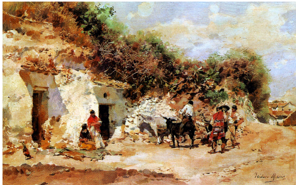
Gypsy caves in Granada

The Alhambra of Granada , palace of sultans and their harems , displays the honeycombed wood and stucco decorations of Moorish artisans. Gypsies still perform flamenco dances in mansionlike caves situated high on the hill of the Sacromonte .