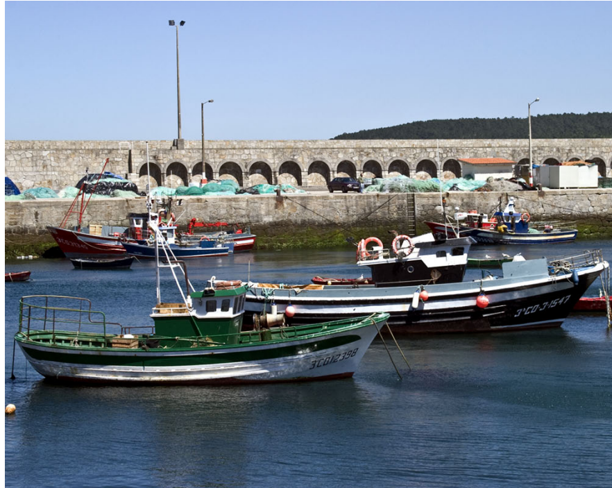
Fishing Boats, Laxe, Galicia

Melodious Galician, with four dialects corresponding to Galicia's four provinces, resembles Portuguese. Used by about two million people in rural areas and primarily within the family, it is not being formally passed on to the next generation.