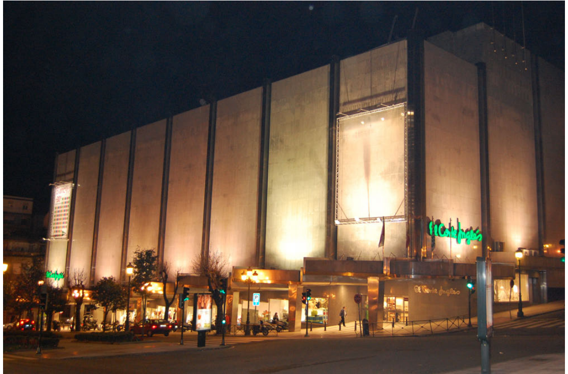
El Corte Inglés in Vigo

Two chains, Galerías Preciados and El Corte Inglés, each with several stores in Madrid and outlets in other major cities, often sell at prices lower than owner-operated shops. Celso García is the most exclusive of Madrid's department stores.