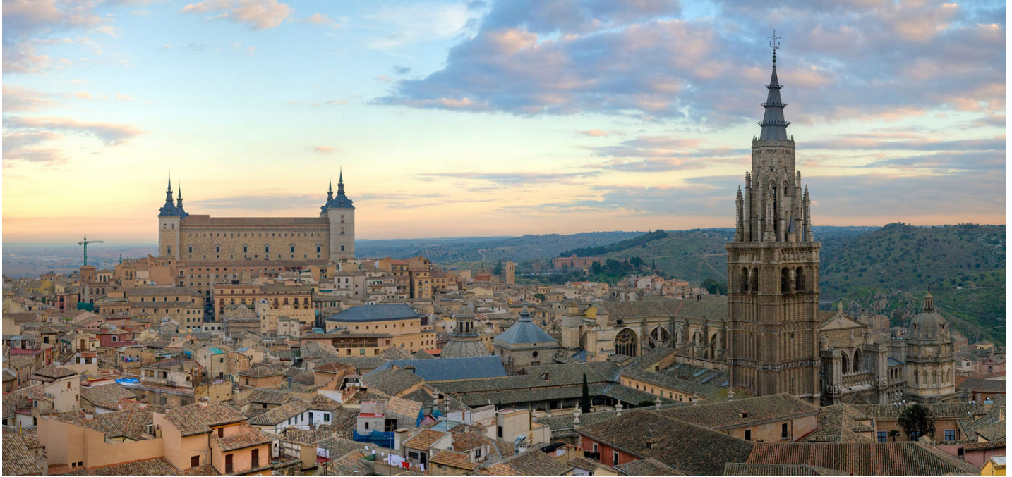
Toledo Spain skyline at sunrise

Photo: DAVID ILIFF Date: 28 Dec 2006 cc-by-sa-3.0