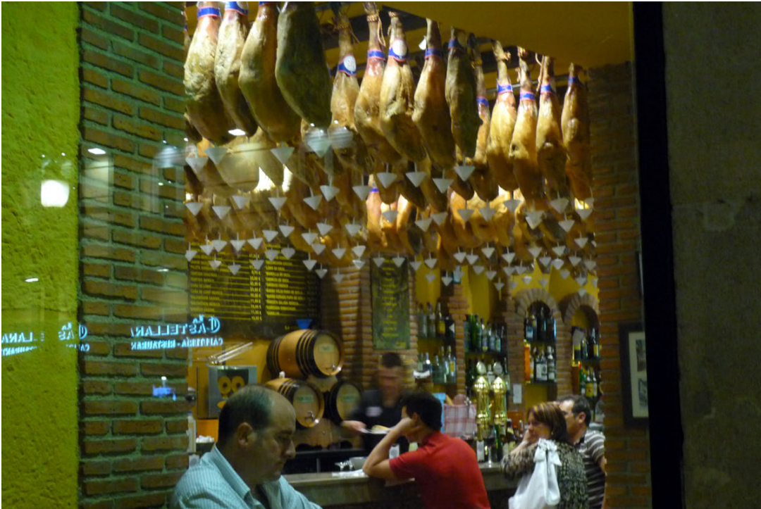
A bar and restaurant in Granada

Brandy, a favorite drink of older Spaniards, is quite sweet. Well-known brands are Fundador , Domecq and Soberano , which is the driest of the three. Esteemed Lepanto and Carlos Primero cost considerably more.