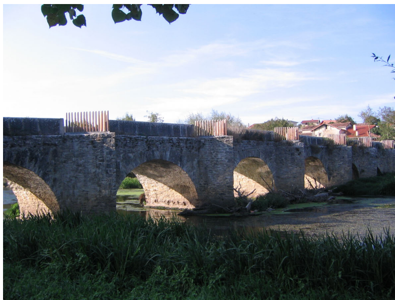
Roman bridge, Alava

Of all the invaders, only the Romans were able to conquer most of the peninsula, which they named Hispania. In the second century B.C., Rome began a lengthy colonization that transformed local laws, politics and language and established Christianity as the dominant religion. Six hundred years of romanization ended when the monarchs of the semicivilized Visigoths founded a kingdom ruled from Toledo.