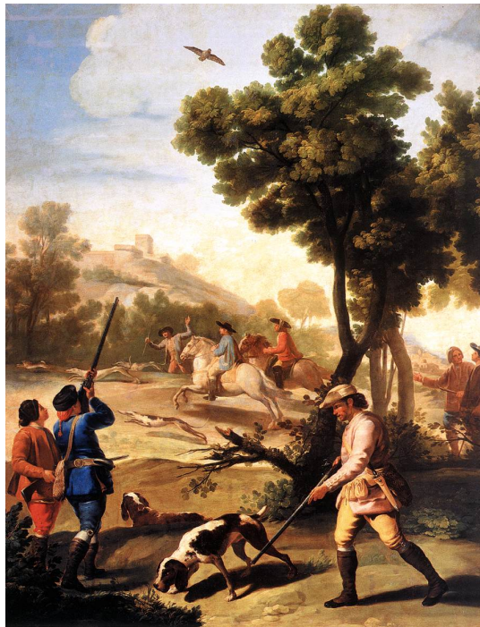
The Quail Shoot - Oil on canvas, 290 x 226 cm Museo del Prado, Madrid Francisco de Goya - 1775 Public Domain

Hunting and fishing in Spain, better provided with game than any other country in Western Europe, are popular pastimes. Of the big game, deer is the most plentiful. Smaller game, especially red partridge, is often shot by the hundreds in organized drives.