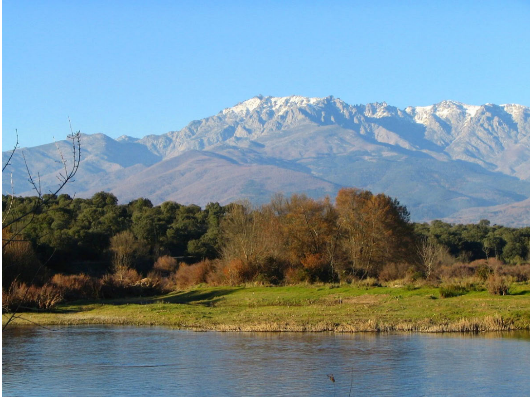
Tiétar River in the Sierra de Gredos, Ávila

Fifty percent of the area of peninsular Spain consists of an arid tableland, the Meseta , almost totally enclosed by the high Sierras of Guadarrama and Gredos and the mountains of Toledo. Other peaks, rising abruptly from narrow bands of coastal lowlands, encircle the interior of the country.