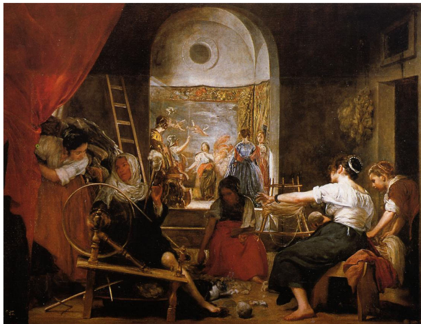
Velasquez' "Las Hilanderas," El Prado. (1657)

To view the art of the Prado Museum , an old and comprehensive picture gallery, takes weeks. Sought-out collections include those of the Spanish painters, especially Velasquez and Goya. Masters from other countries are also represented.