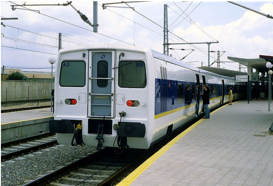
A low-gravity TALGO

Rail fares are determined not only by the distance traveled, but also by the kind of train traveled on. Three kinds of express trains--diesel TALGOs and TERS and electric ELTs--charge a supplement per kilometer in addition to the regular fare. TALGOs link Madrid with other large cities. ELTs and TERS, which serve smaller cities as well, are slower and make more stops. All three offer first- and second-class seating and sleeping accommodations.