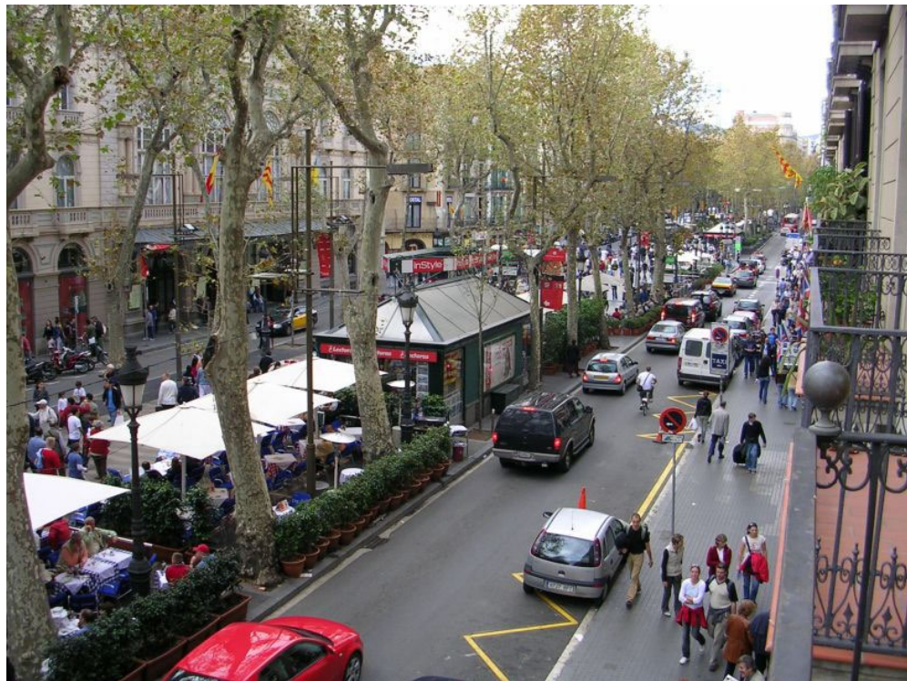
Ramblas in Barcelona

Book stalls and well-known landmarks line the Ramblas , a succession of colorful avenues running from the waterfront to Barcelona's center. While pedestrians stroll down the tree-shaded middle section, traffic roars by on either side.