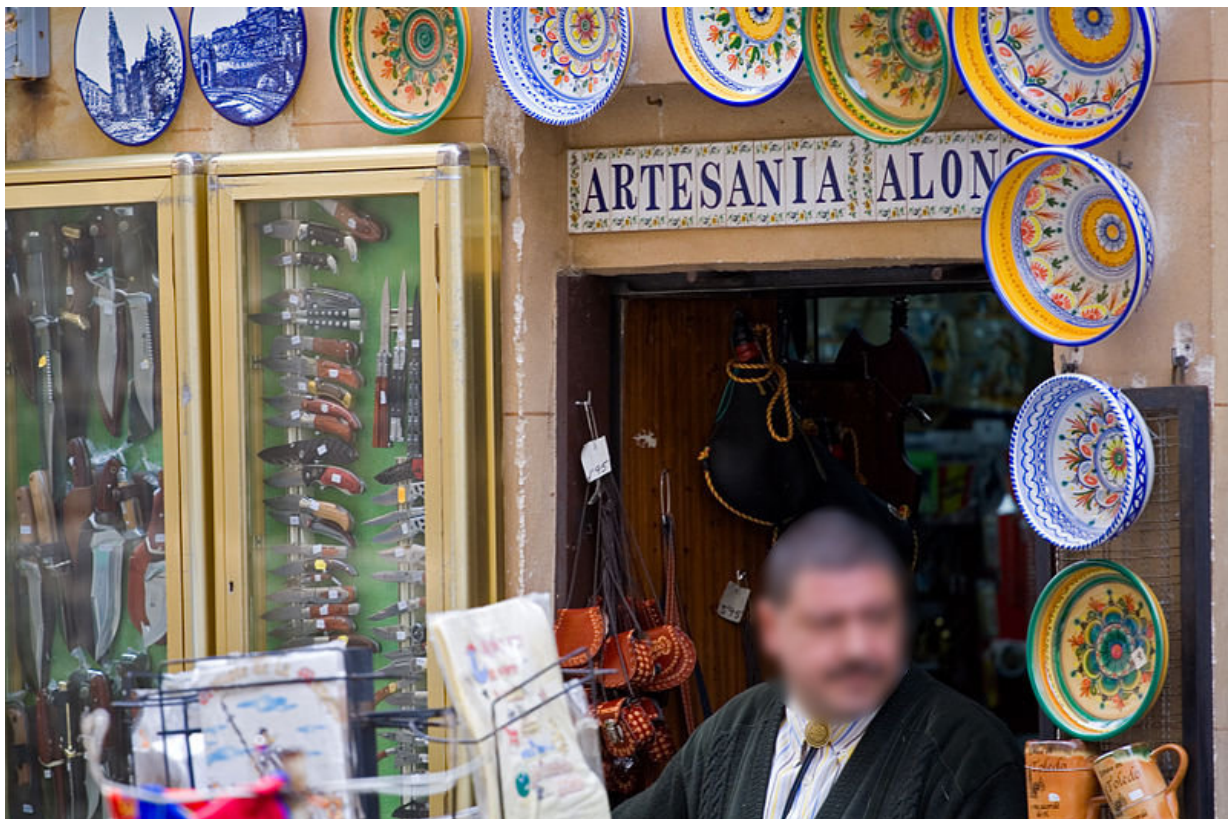
A shop across the street from the side of the Cathedral in Toledo.

Even though Spain is now the fifth most industrialized nation in Europe, popular handi-crafts are still obtainable. Many stores stock classic Talavera and Muel ceramics, which can also be purchased in the towns of the same names. Valencia produces handcrafted wooden furniture in a variety of modes, and Alicante exports its exquisite handmade toys all over the world.