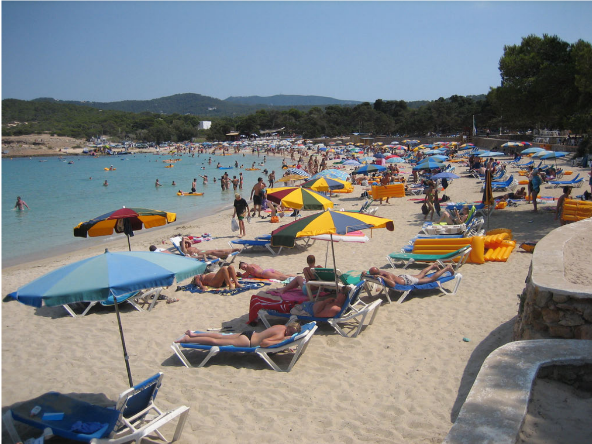
Cala Bassa beach, Ibiza, Balearics

Date: 11 Jul 2006 cc-by-sa-2.0