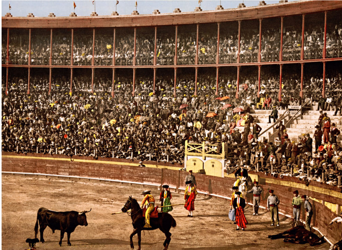
Bullfight in Barcelona, Spain

Last comes the matador , dressed in a glittering suit of lights ( traje de luces ), to dispatch his specially bred opponent. After playing the beast with a red cape ( muleta ), the matador plunges his short sword ( estoque ) into the neck. The first thrust, the "moment of truth," should kill.