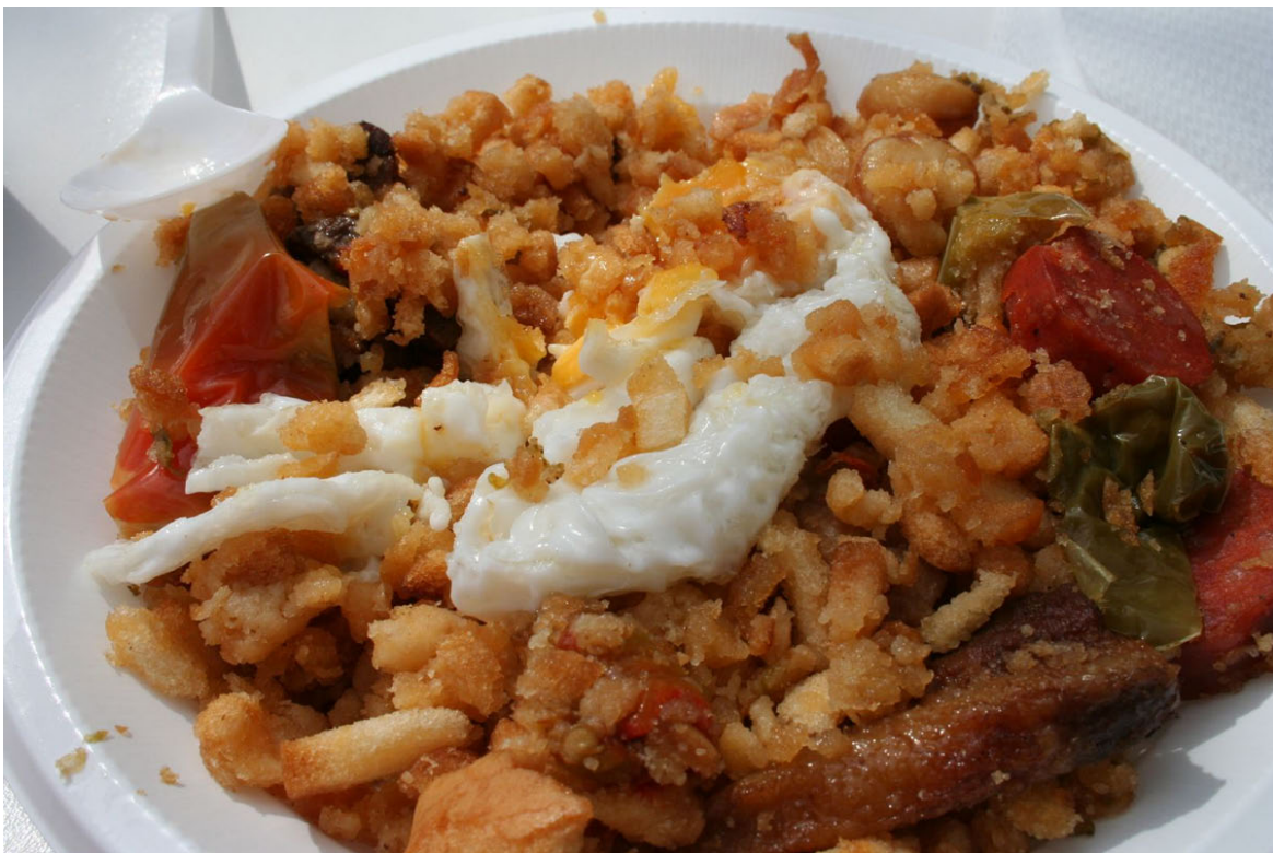
A Manchegan meal (migas)

Spanish cooks prepare legumes in a variety of ways. Madrid's special stew ( cocido ), made with chick peas and beef, chicken or bacon, is a meal in itself when eaten with bread and a glass of wine. Asturians favor a simple cassoulet of white beans with salt pork and sausage ( fabada ) and Basques choose a peppery sausage ( chorizo ) stewed with red or white beans.