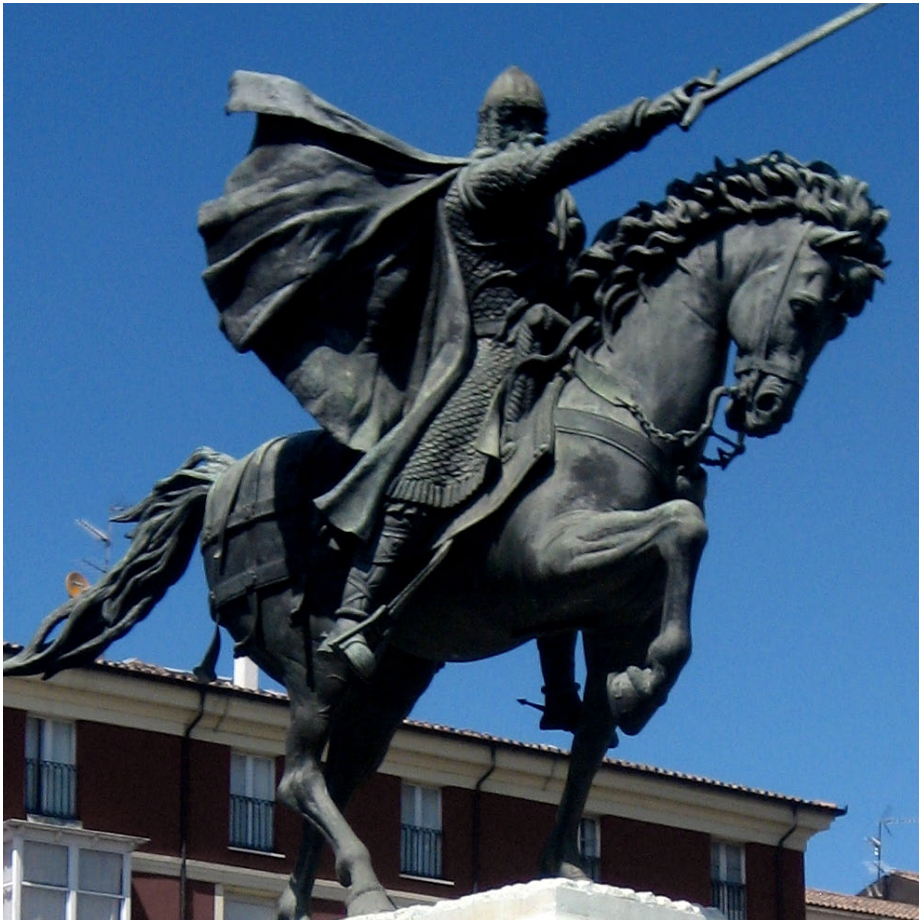
Statue of El Cid, hero of the Reconquest, Burgos. (Detail)

By the seventeenth century, plagues and unceasing military campaigns had drained Castile's treasury. In 1700, the death of Charles II, last of the Hapsburg rulers, brought about the War of Spanish Succession in which the House of Bourbon eventually came to Madrid from France. It was during this dynastic change that Spain lost nearly all her European possessions.