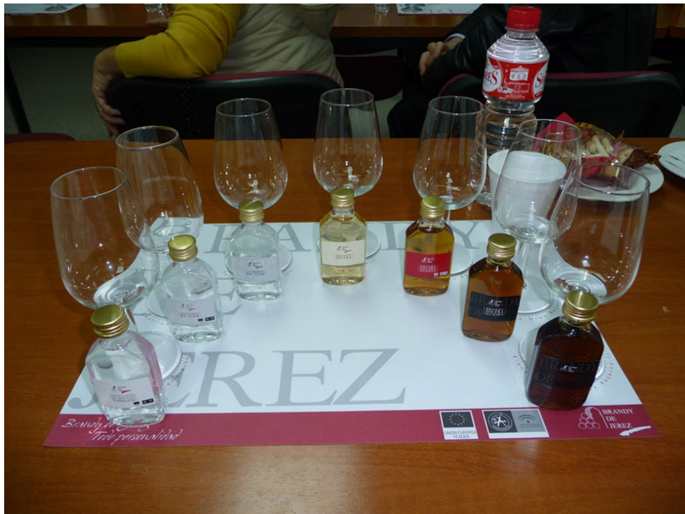
Brandy de Jerez (Sherry) tasting session in University of Cadiz

Sherry is made only from vines grown in the chalky soil of the province of Cadiz, chiefly around the town of Jerez de la Frontera. So-called sherries from other countries are imitations.