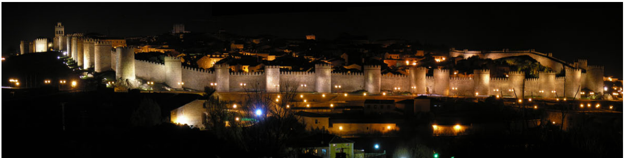
The walls of Avila at night

A few miles northwest of Madrid lies the austere Royal Monastery of El Escorial , granite burial place of kings and queens of Spain. Nearby the former chief-of-state Generalissimo Francisco Franco is interred at the Valley of the Fallen Monument , dedicated to the victims of the Spanish Civil War.