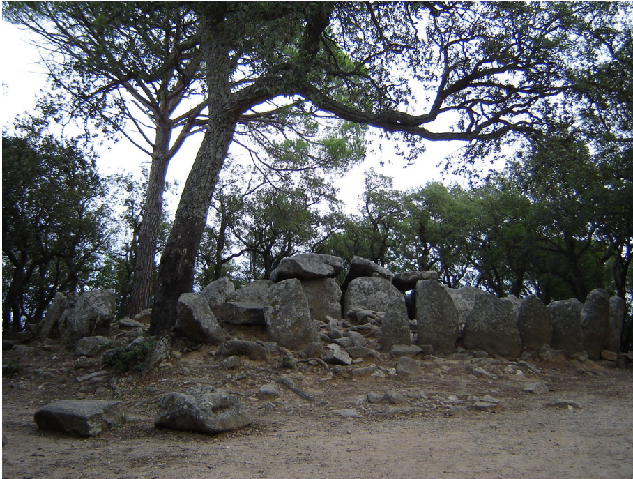
Dolmen Cova d'en Daina (Romanyà de la Selva, Catalonia)

Early inhabitants, paleolithic hunters (15,000 B.C.) of Altamira, painted nearly life-sized deer and bison on cave walls. Isolated by the mountain ridges of the Pyrenees, a race of mysterious origins, the Basques, has continued to preserve its unique customs and language for thousands of years.