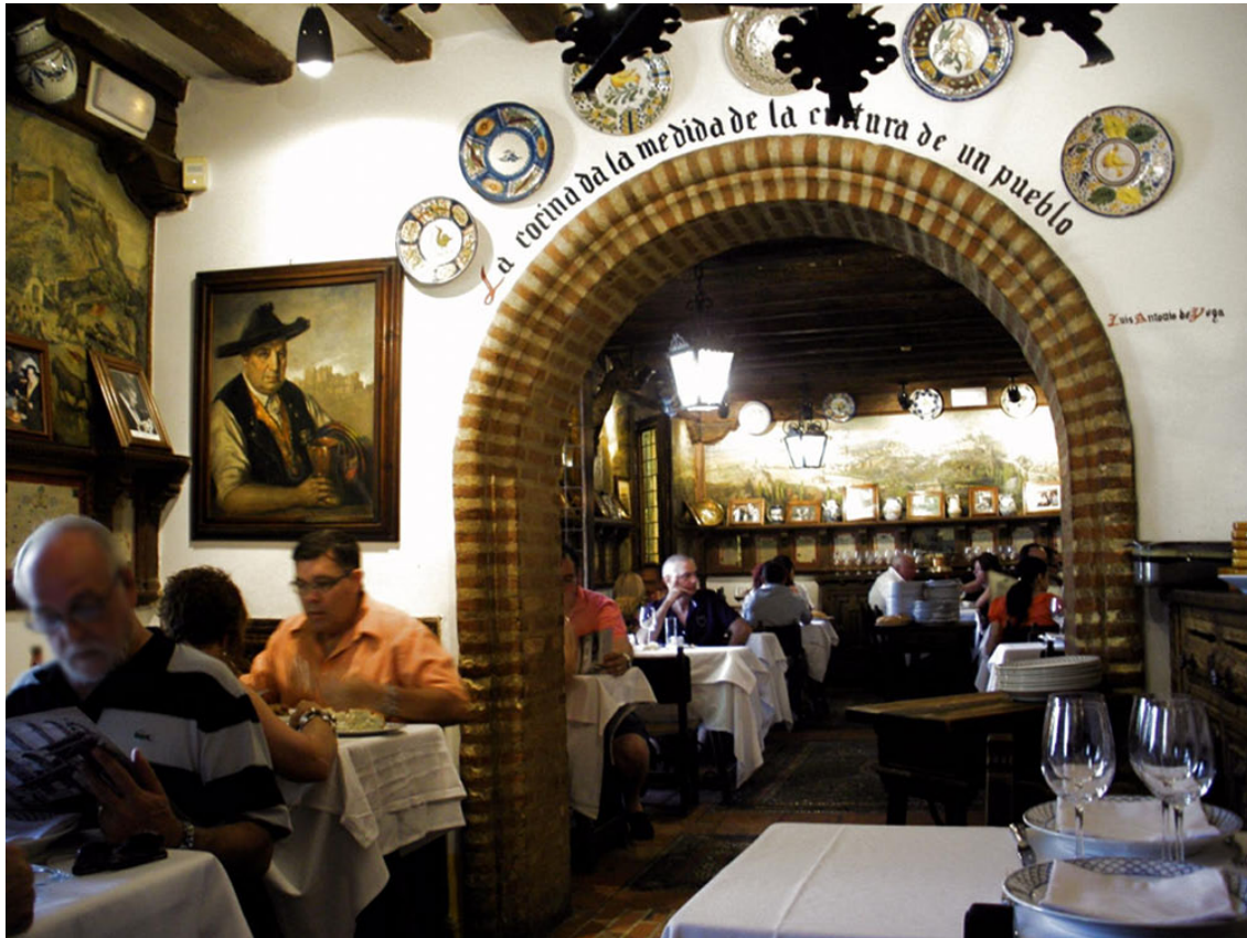
Mesón de Cándido, en Segovia (Castilla y León, España)

Date: 23 Aug 2009 Public Domain CC0